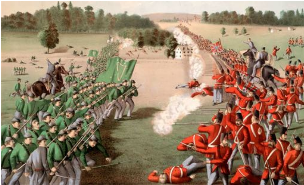
Finians Raid. https://archive.org/stream/cihm_23395